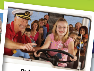
Drive the Duck if you want!