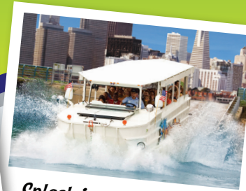
Splash into the bay and cruise McCovey Cove!